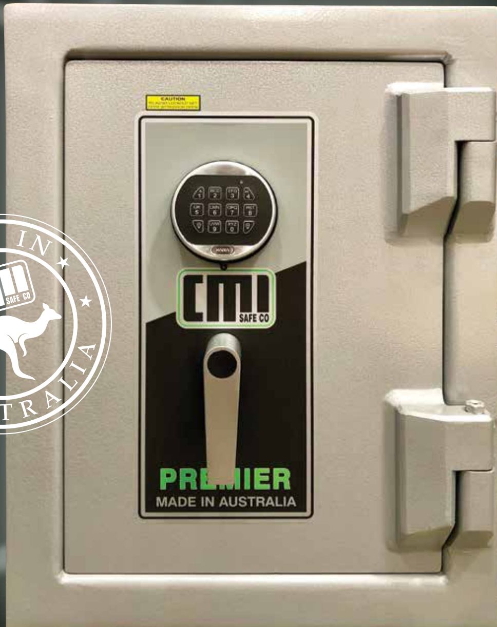
■ MODEL PRB