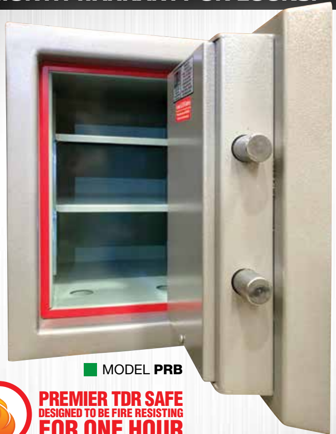
■ MODEL PRB